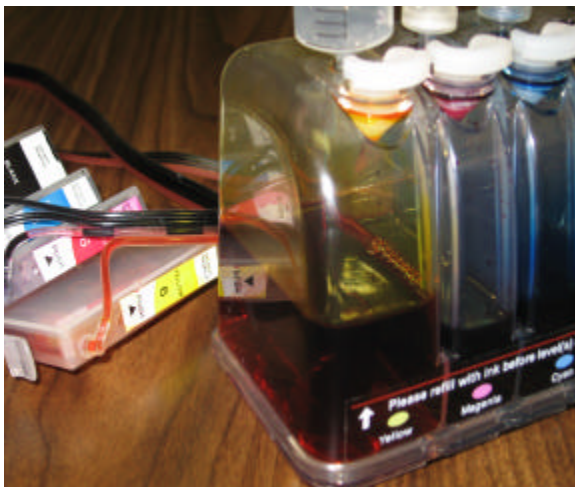
Fig 2.2: Air out of tubing.