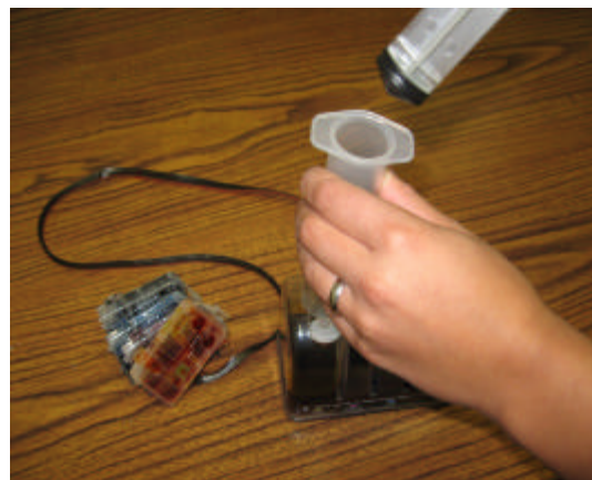
Fig 3.3: Top of syringe removed